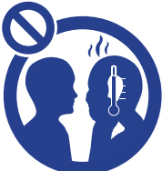
Do Not Meet Infected or Sick People