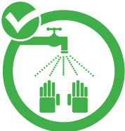
Wash Hands Thoroughly