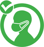
Use Face Mask or Respirator