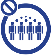
Avoid Large Crowds