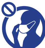
Do Not Touch The Front Part of a Mask