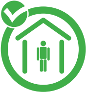
Stay at Home if Possible