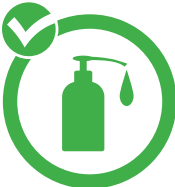
Use Soap or Hand Sanitizer