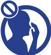
Do Not Touch Your Face esp. Mouth, Eyes, Nose